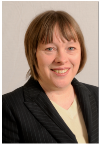
Maria Eagle MP Shadow Secretary of State for Transport

Rail is the great transport success story of our age, with more people travelling by train than at any time for almost a century. There has been a 6% increase in passengers in the last year, while Integrated Transport Authorities across the North of England have seen rail growth of more than a fifth during the past decade. Record investment over that period has seen reliability, punctuality and safety all improve while journey times have been substantially reduced on many routes.