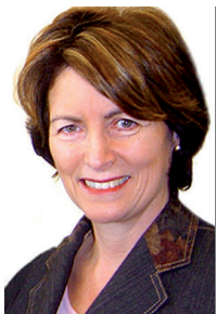
Louise Ellman MP Chair, House of Commons Transport Select Committee

The main challenge in rail policy today is to enhance the network whilst bringing down the cost to both the taxpayer and passengers. A successful outcome appears within the Government's grasp, but it will require firm leadership from ministers as well as from those within the rail industry to achieve this goal.