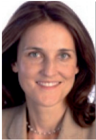
The Rt Hon Theresa Villiers MP Minister of State for Transport

For nearly 200 years, the railway has been bringing prosperity to the North. Connecting people with the workplace, and goods with the marketplace. Providing the links on which businesses rely. And the Coalition Government believe that rail can play a vital role in spurring growth in modern Britain. That's why the Coalition is today overseeing the biggest rail upgrade programme since the Victorian era.